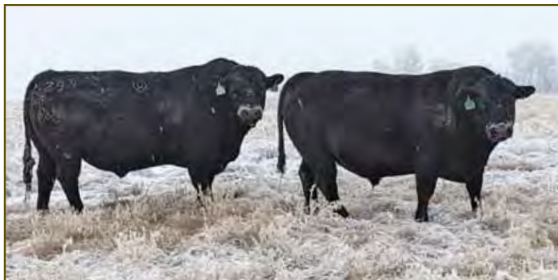
Herdsmen out grazing January 2024

At Ole Farms we use our best land to produce high value crops like corn and canola. We graze corn and corn stover and use canola straw as feed and bedding.