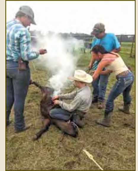
Hard at work