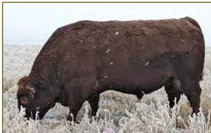
Red Mustrush Julian 84S A092

EPDs: CED: +9.0 BW: -0.9 WW: +28 YW: +45 MCE: +10.0 MILK: +32 SC: +0.65