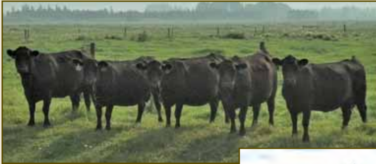
Lined up for evaluation