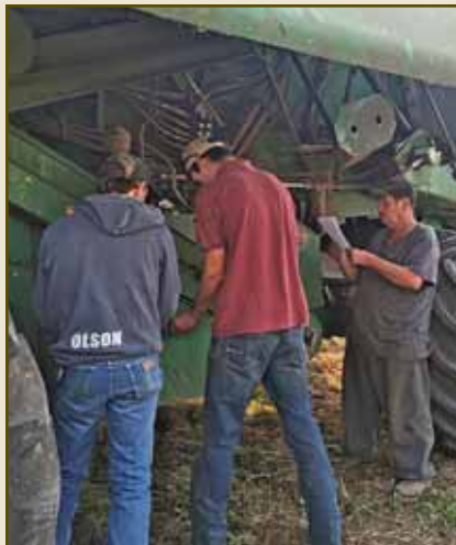
We got this!