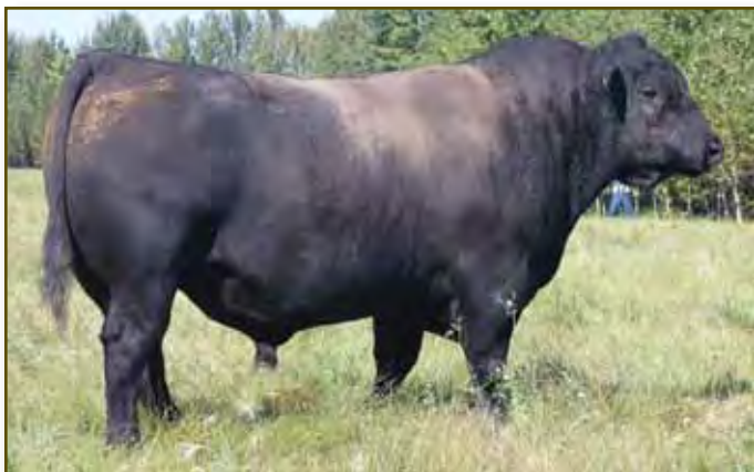
O C C Legacy 839L