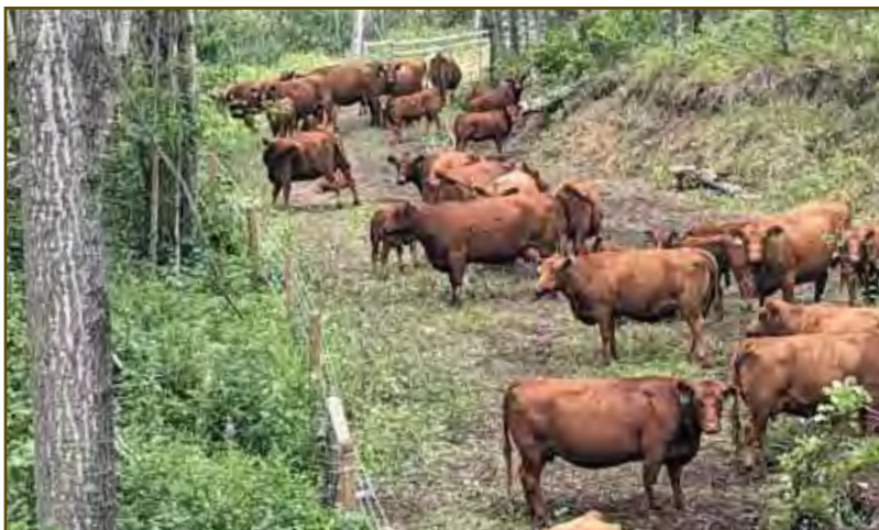
Deep in the forest

EPDs: CED: +8.0 BW: -0.8 WW: +38 YW: +59 MCE: +8.0 MILK: +29