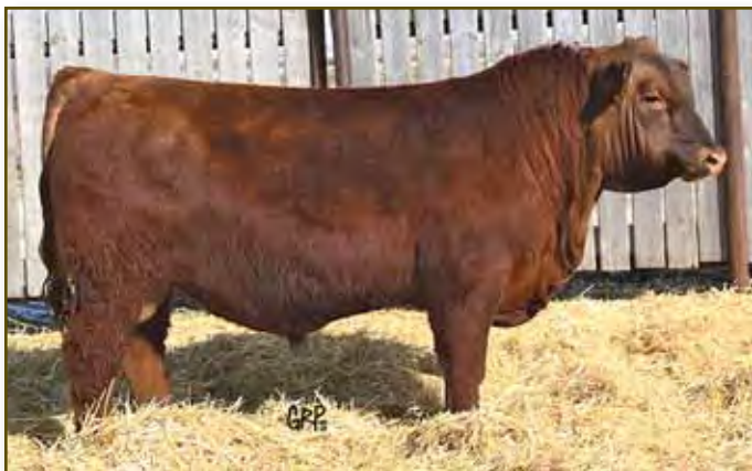
Red Flying K Thunder 231G