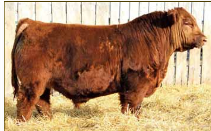
Red MRLA Resource 137E

A grandson of S A V Resource. Progeny have muscle and performance. Thirty open Red Resource daughters averaged $9000 at the U2 Dispersal. Top 20% of breed for yearling weight.