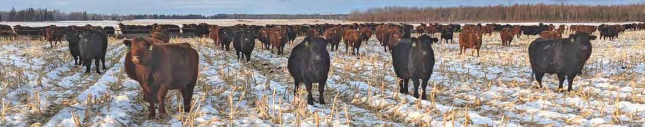
Kelly & Graham

This year at OLE Farms was a good production year. We had a dry spring, followed by a wet summer, and then a dry fall. The cattle are doing well. We are blessed with a dedicated group of employees that make life enjoyable. We are proud of our offering of bulls and bred heifers for this 19th sale. We sell only 2 year old bulls (approx. 21 months), that have been developed so that they won't melt away on your farm. Our bulls are not pampered, pushed or picked over. Our heifers were AI bred to some of our best, proven easy calving bulls, for April 15th calving. They are ready to work for you. Feel free to visit anytime or call us with questions. We want to share in the excitement of agriculture with you.