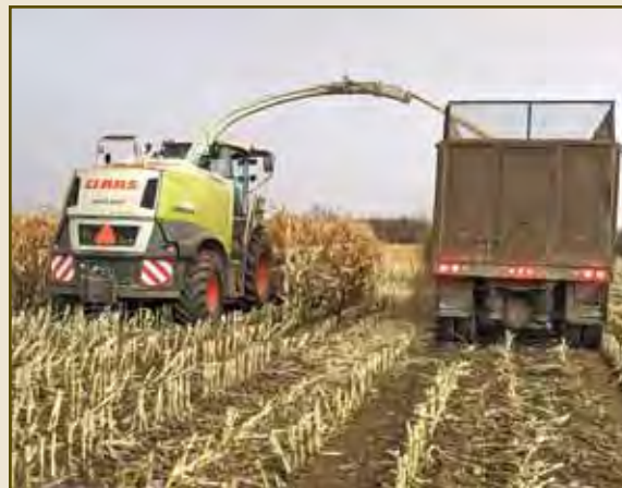
Chopping the corn silage