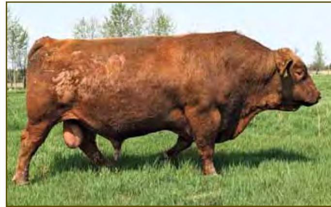
Red Mushrush Julian 84S A092

A092 is a bull that we bought from Mushrush Red Angus in Kansas in 2014. He will be 11 years old in March and is still sound and working well. He is sired by the well known Julian 84S. He portrays the longevity we are looking for so we have begun using him extensively in our AI program.