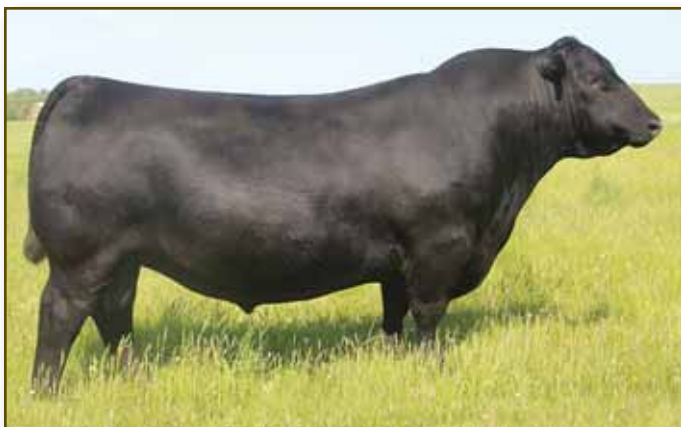
S A V Rainfall 6846