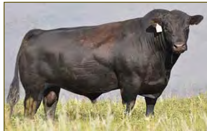
XO Crowfoot 0102X

EPDs: CED: +5.0 BW: +1.3 WW: +37 YW: +63 MCE: +6.0 MILK: +31 SC: +0.76