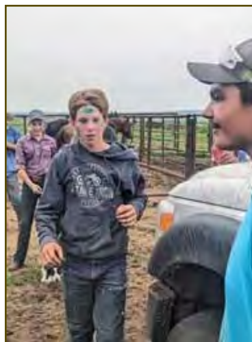
We try to have a little fun every day!

At Ole Farms we are in the process of eliminating cattle access to water bodies. We have several miles of water pipelines to bring water to various paddocks. We have most dugouts fenced and have recently fenced out a half mile of lake frontage. Clean water is better for the cattle and the environment.