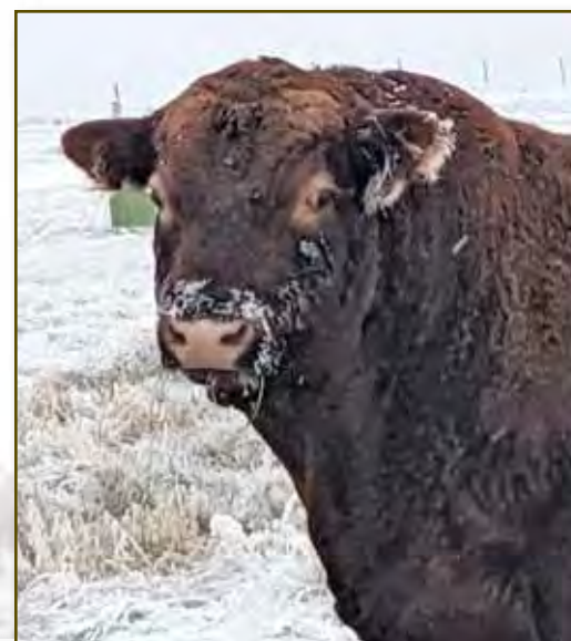
Red Flying K Dante 261D

EPDs: CED: +5.0 BW: -0.2 WW: +44 YW: +69 MCE: +6.0 MILK: +28 SC: +0.70