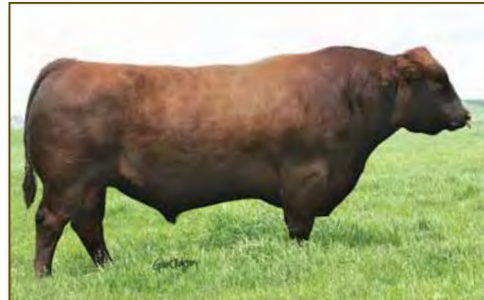
1G Sire: Red Crowfoot Ole's Oscar 2042M

A bull we raised out of our Ole Oscar bull, who improved our Red program early on. Here is a heifer bull with style.