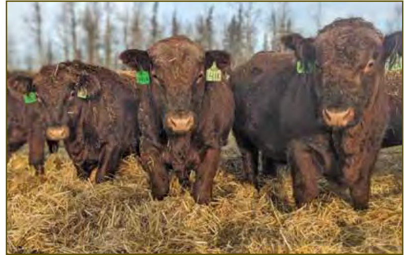
We are ready to work for you

EPDs: CED: +1.0 BW: +2.3 WW: +51 YW: +83 MCE: -1.0 MILK: +25