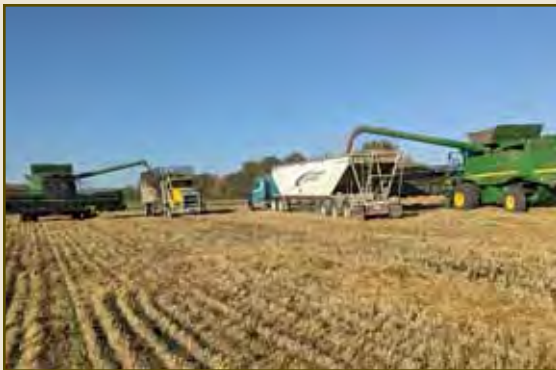
Busy day in the field