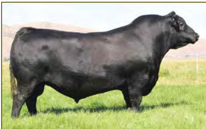
Coleman Bravo 6313