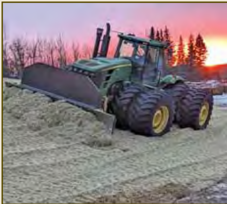
Pack it well