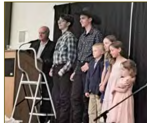
Grandpa & the Grandkids