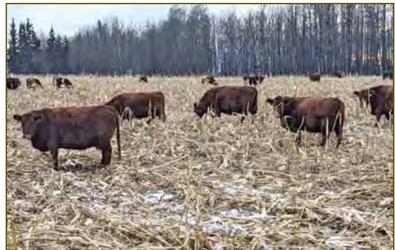
Red cows on stover

In April each year, prior to calving, we mouth our older cows. If they are smooth mouthed ie: teeth missing, we calve them out, wean early and sell them in early September before the fall run.