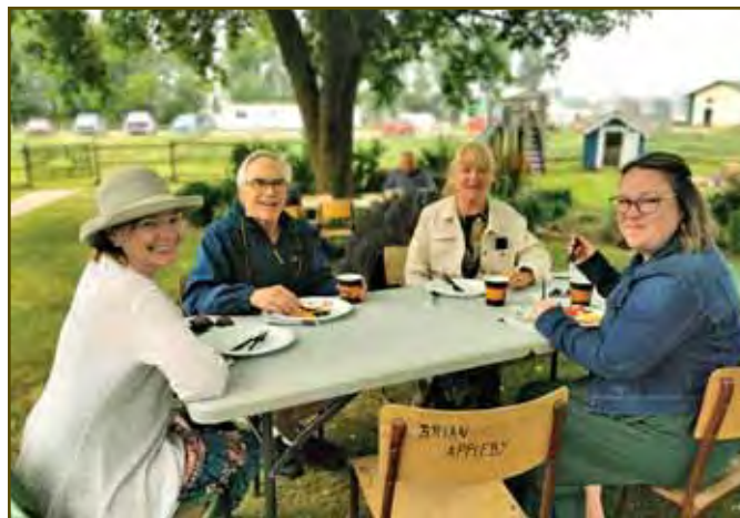
A beautiful day for a celebration