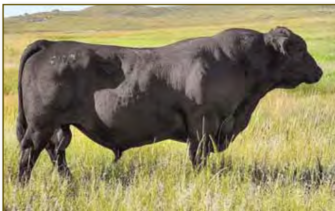
Ole Fahrens Blaze 723C

EPDs: CED: +9.0 BW: +0.4 WW: +25 YW: +43 MCE: +6.0 MILK: +19