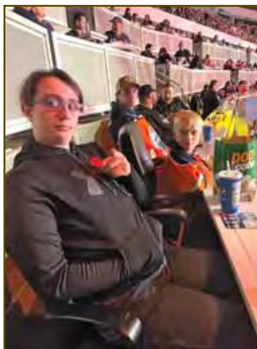
Got to take my grandsons to an Oiler's game

EPDs: CED: +2.0 BW: +1.7 WW: +26 YW: +43 MCE: +7.0 MILK: +19