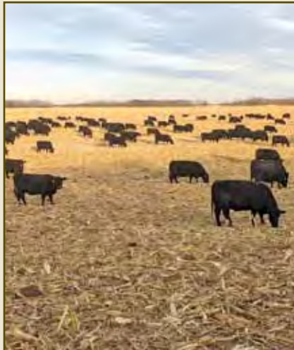
Great feed, stovers in December