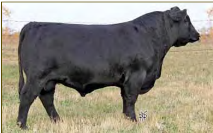
Fraser Poker Face 613D

EPDs: CED: +8.0 BW: -0.4 WW: +38 YW: +62 MCE: +9.0 MILK: +16 SC: +0.66