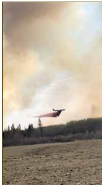
Thanks to quick work by the water bombers we didn't lose any pasture or fence last spring

EPDs: CED: +7.0 BW: +0.9 WW: +68 YW: +117 MCE: +10.0 MILK: +25