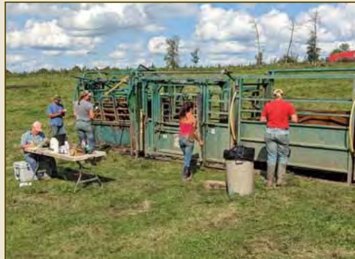
Another day at the office in July