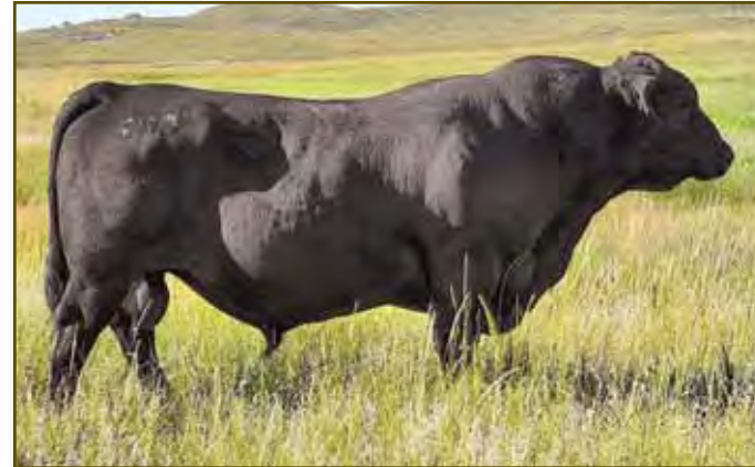
Ole Fahrens Blaze 723C

A 50H son that we sold to Hague Angus in Nebraska in our 2017 Sale. He is taking his sire's place, continuing the tradition of low birth weight (top 6% of the breed) and high calving ease (top 4%) He has an impressive phenotype and makes great daughters.