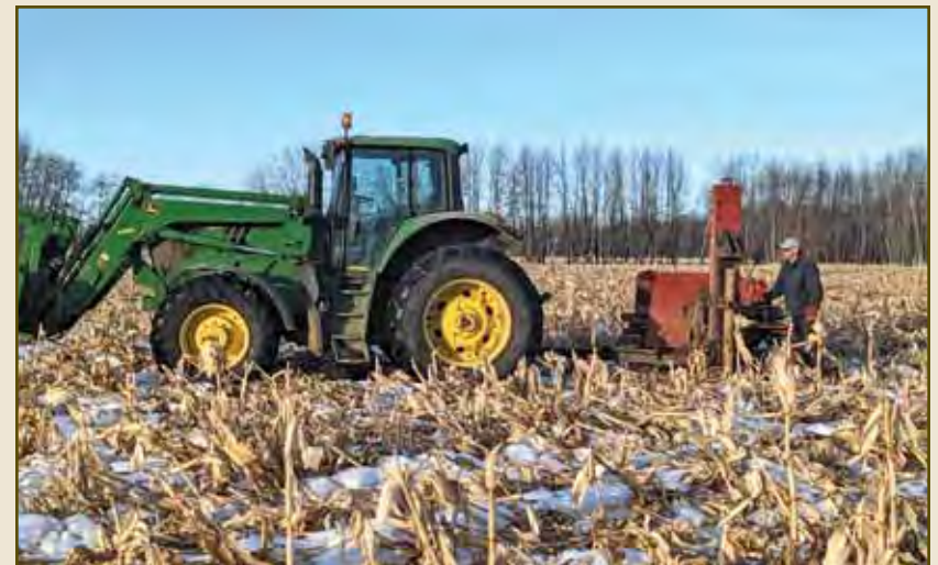
There is always another post to pound