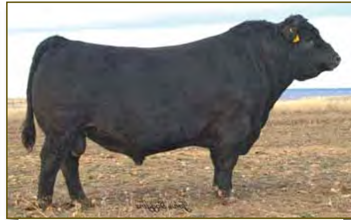
DDA Emblazon 27C

We have used 27C as an AI sire for over a decade. His sons have been very popular. His calves just plain work. He has a very maternal pedigree, from the breed legend dam DDA Melissa 824. An excellent calving ease sire, with top 10% of the breed for calving ease.