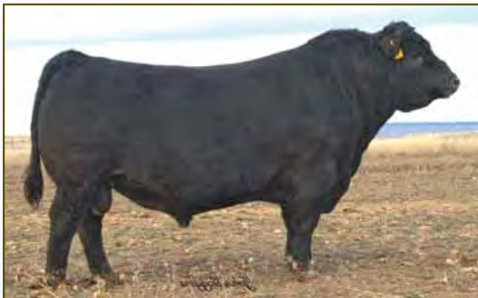
DDA Emblazon 27C

EPDs: CED: +8.0 BW: -0.4 WW: +30 YW: +45 MCE: +9.0 MILK: +24 SC: +0.37