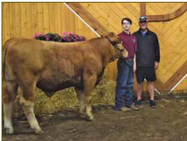
Ace & steer - Buyer: Koch Ford

EPDs: CED: +7.0 BW: +0.6 WW: +53 YW: +97 MCE: +4.0 MILK: +26