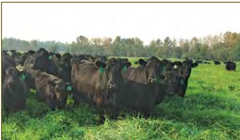
Good Cows + Good Grass = Great Beef

EPDs: CED: +10.0 BW: -1.0 WW: +45 YW: +74 MCE: +4.0 MILK: +26