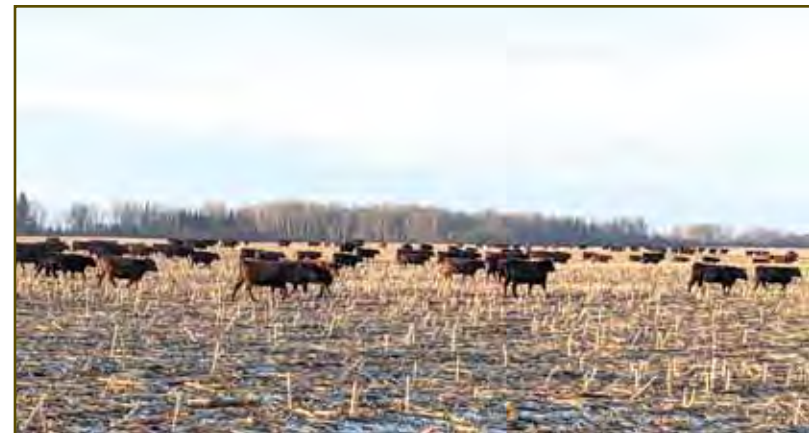
Heifers on the move

EPDs: CED: +4.0 BW: +1.1 WW: +36 YW: +57 MCE: +8.0 MILK: +29