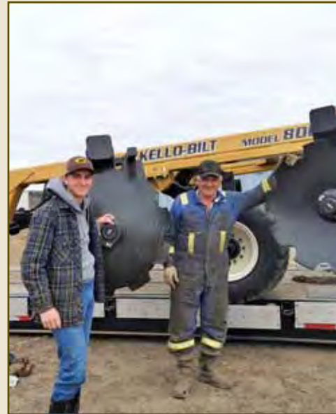
Are the new blades or the smiles larger?