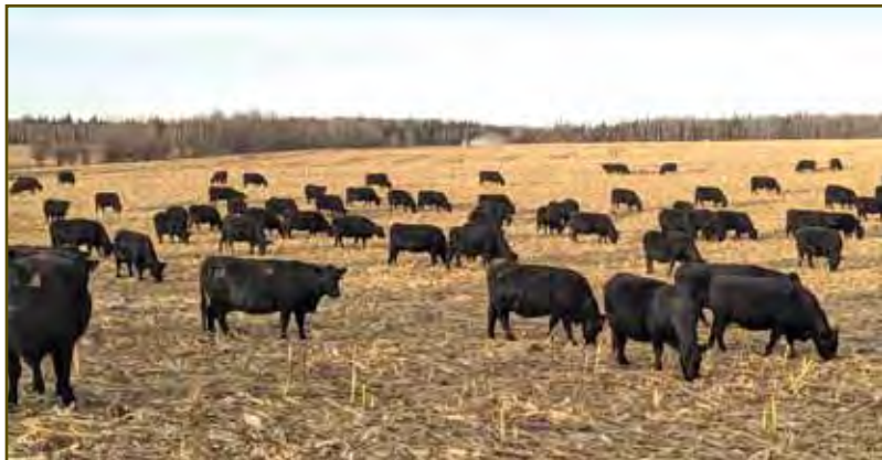
Good clean up on the stover

EPDs: CED: -1.0 BW: +4.9 WW: +42 YW: +77 MCE: +2.0 MILK: +25