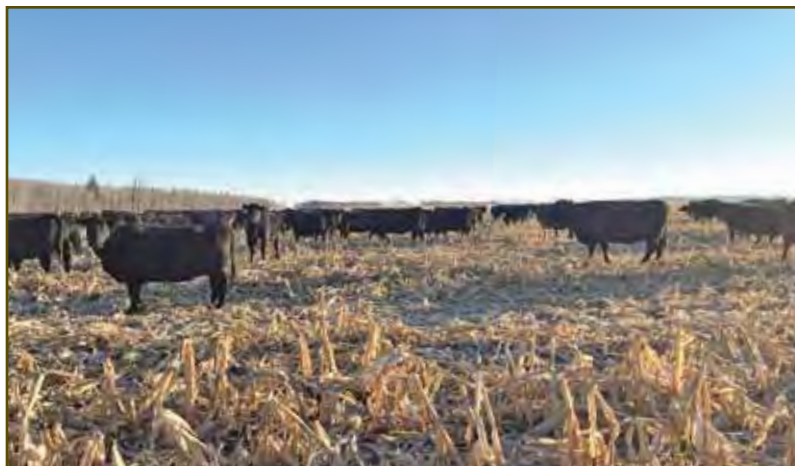
January 2024 - grazing through the snow - without snow!

EPDs: CED: +2.0 BW: +1.5 WW: +36 YW: +59 MCE: +6.0 MILK: +21