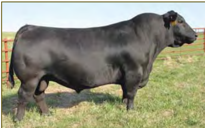
S A V Resource 1441

EPDs: CED: -2.0 BW: +4.4 WW: +58 YW: +110 MCE: +0.0 MILK: +19