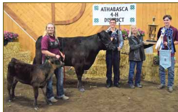
Interclub Reserve Grand Champion Cow/Calf Sponsored by Marches Red Angus Interclub Reserve Grand Champion Female Overall Sponsored by Brokerlink Athabasca