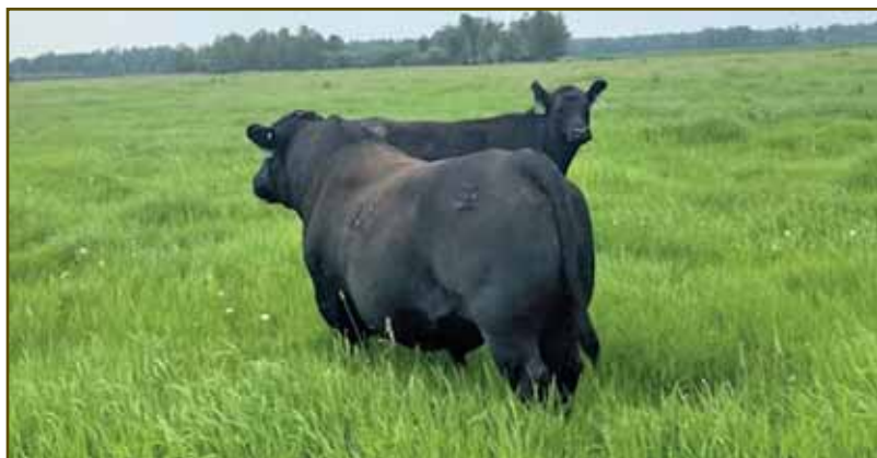
Holistic of Hague 001 (© C C Unlimited 940U son) Progeny sells in 2025

EPDs: CED: +1.0 BW: +3.0 WW: +52 YW: +86 MCE: +5.0 MILK: +19 SC: +1.17