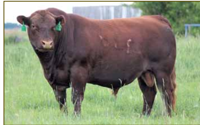
Red Ole Magua 709B

EPDs: CED: +7.0 BW: +0.3 WW: +33 YW: +53 MCE: +7.0 MILK: +16