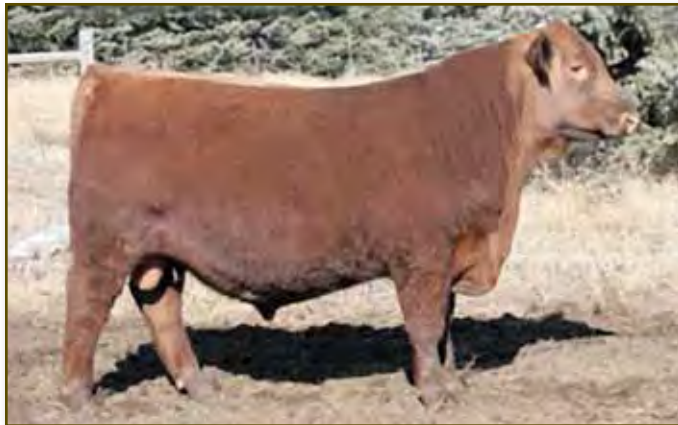
Red Mlk Crk Impressive 1144

EPDs: CED: +10.0 BW: -0.8 WW: +40 YW: +70 MCE: +10.0 MILK: +27 SC: +0.95