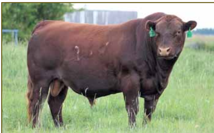
Red Ole Magua 709B