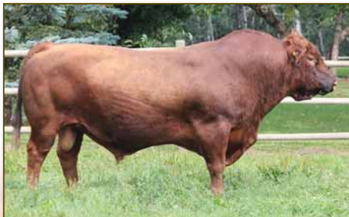
Red U-2 Foreigner 413B

EPDs: CED: +4.0 BW: +1.2 WW: +51 YW: +78 MCE: +7.0 MILK: +18