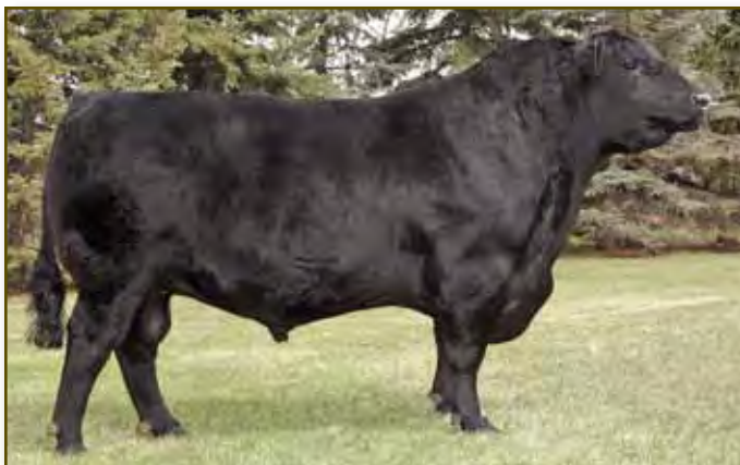
WAF Zorzal 321U

EPDs: CED: +9.0 BW: +0.5 WW: +52 YW: +86 MCE: +12.0 MILK: +23